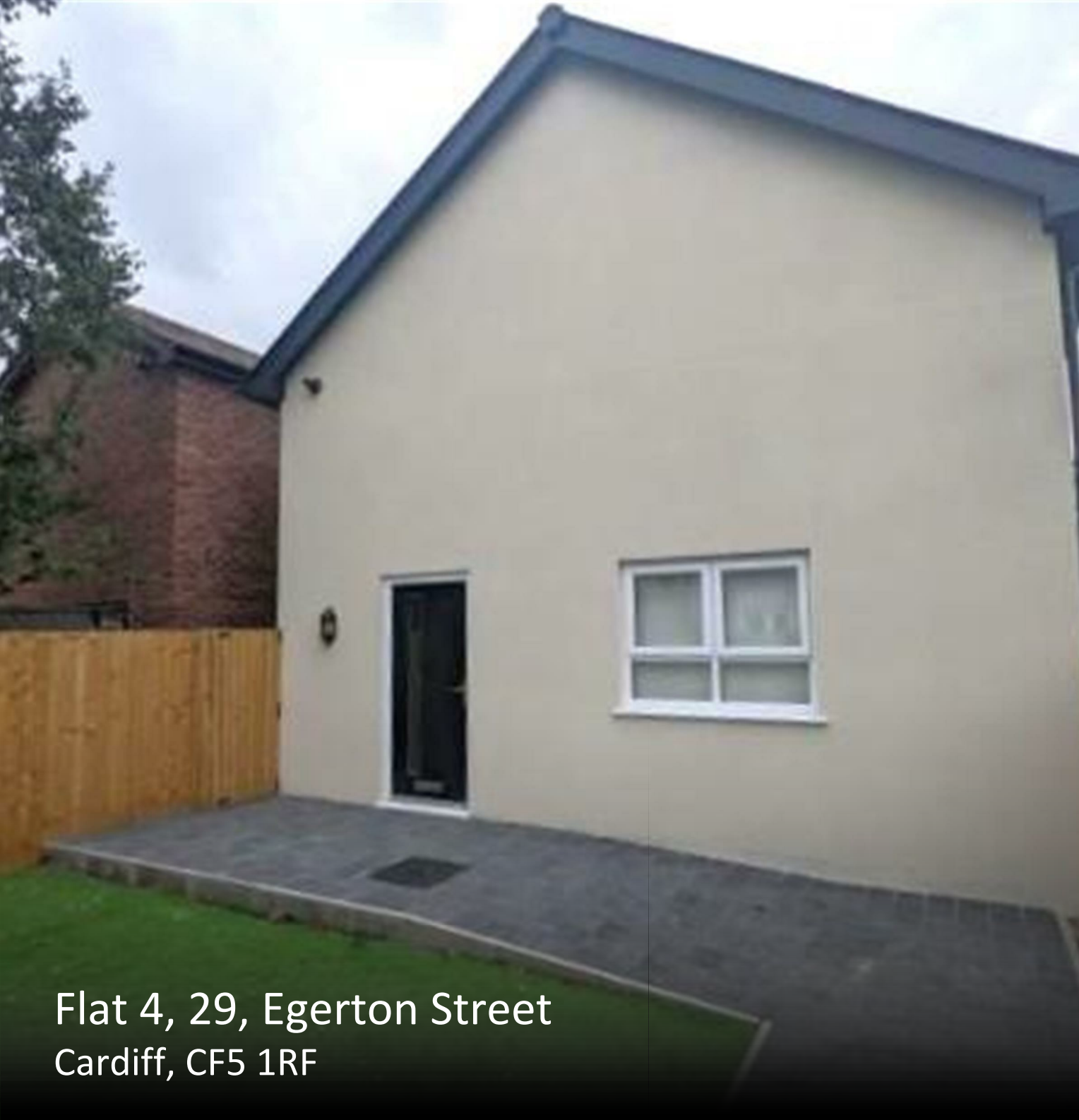
Flat 4, 29, Egerton Street Cardiff, CF5 1RF